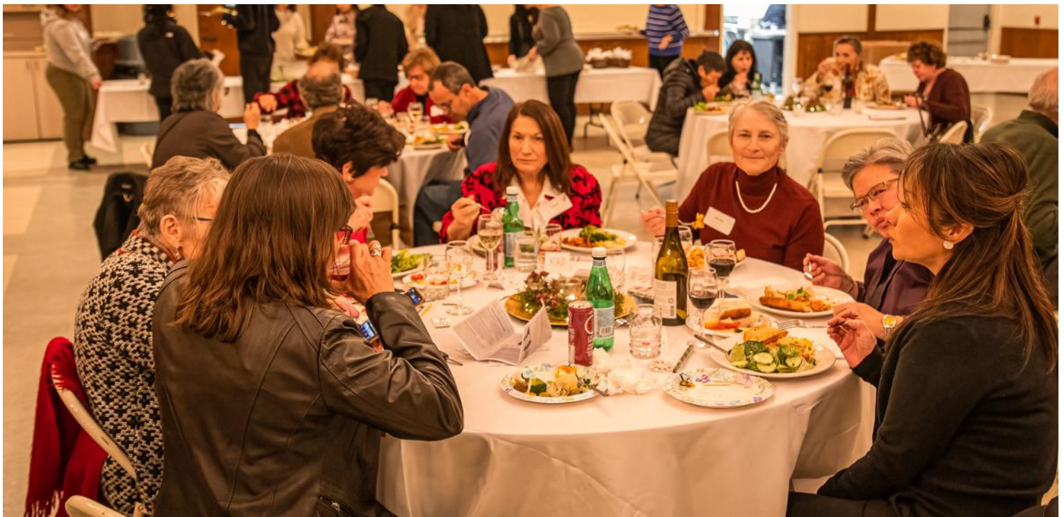
Many members of the Rossmoor Advocates for Diversity group attended the Awards Dinner in support of the organizing committee!