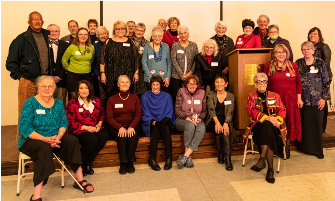
Rossmoor Advocates for Diversity Organizing Committee + Members